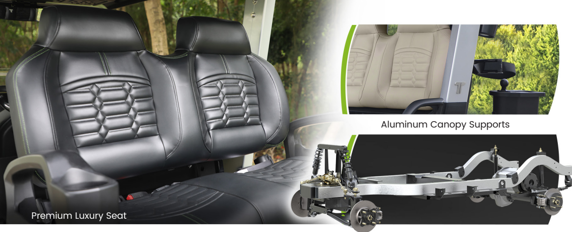
Premium Luxury Seat