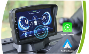
9" Touchscreen with carplay compatibility