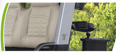
Aluminum Canopy Supports