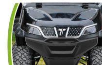
Led brake lights and turning signals