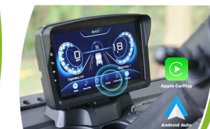
9" Touchscreen with carplay compatibility