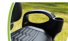
Rear armrest with built-in storage compartment