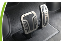
Accelerator / brake pedal