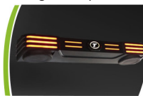
Cuboid sound bar