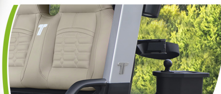
Aluminum Canopy Supports