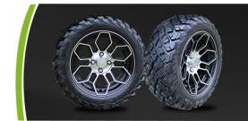
14" Aluminum wheel/ 22x10-14 silent tire with off-road thread