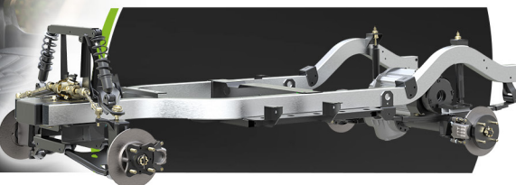
Aluminum Chassis & Hydraulic Brakes