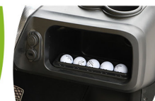
Storage compartment with golf ball & tee holder