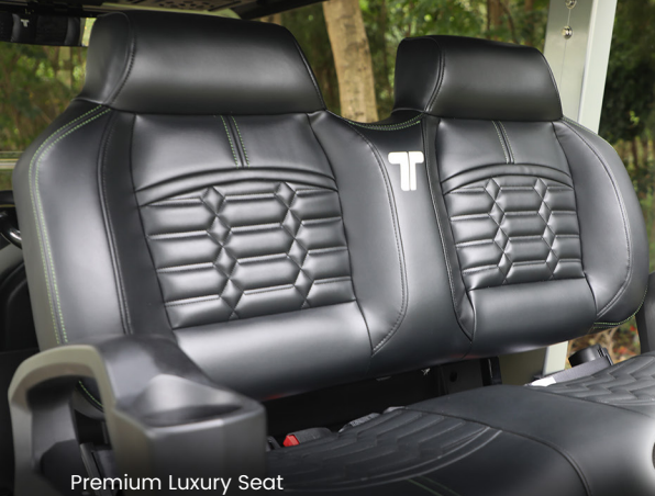
Premium Luxury Seat