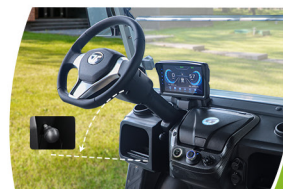
Adjustable steering column