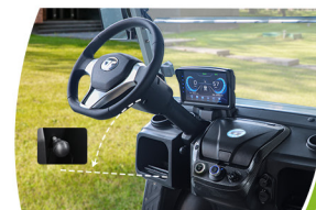
Adjustable steering column