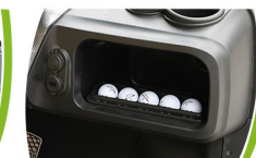
Storage compartment with golf ball & tee holder