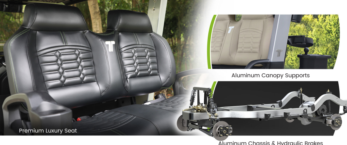
Premium Luxury Seat