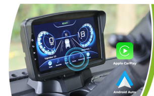
9" Touchscreen with carplay compatibility